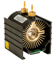
Xenon Replacement Lamp Module for Xenalux