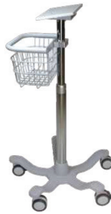
Optional mobile Floor Stand offers vertical support